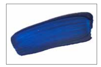
CPWSM08 Phthalo Blue GS PB15:3