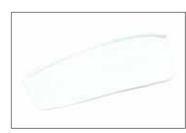
CPWSM14 Titanium White PW6